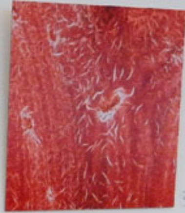
Microscopic image of a red, fibrous biological tissue with a complex, interconnected network of fibers, possibly representing connective tissue or muscle fibers.