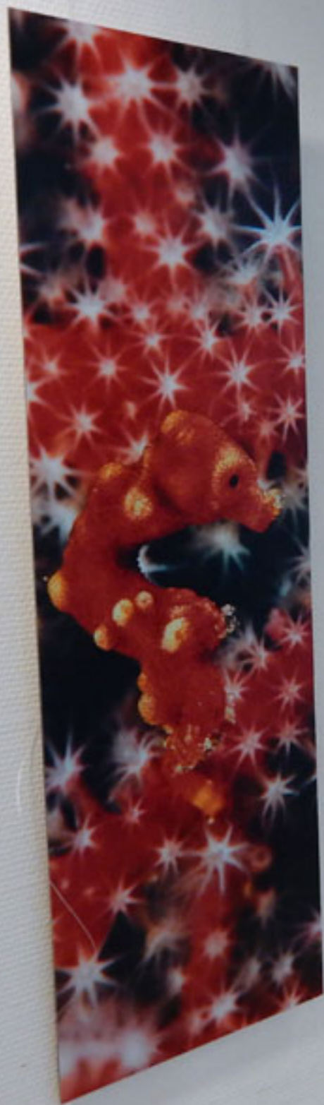
Small white label with illegible text.