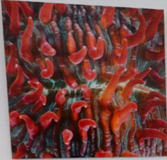
Microscopic image showing a dense field of red, elongated biological structures, possibly cilia or flagella, against a dark background.